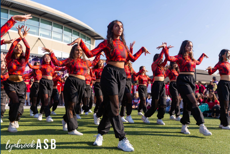
Senior Girls Dance