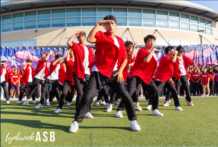
Senior Boys Dance