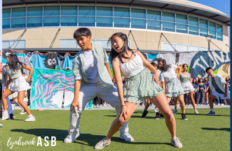
Junior Coed Dance