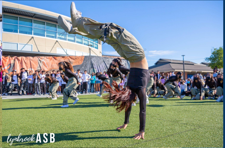
Junior Girls Dance